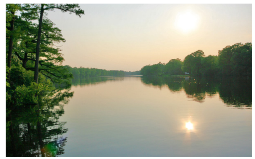
Sun over the peaceful Meherrin River in Hertford County, North Carolina.

The Meherrin River is famed for its herring runs, which supported a vibrant fishing industry through much of the 1900s. In Lawrenceville, the river flows by historic Fort Christianna, which once served as a frontier outpost during the