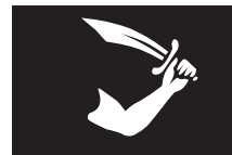
Thomas Tew's flag