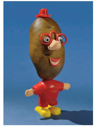
This Mr. Potato Head doll, from the museum collection, is a later example—its head is also plastic.

Suggested Supplies: sweet potato, toothpicks, bamboo skewers, foam pieces or construction paper, pipe cleaners, thumbtacks, scissors, tape, markers