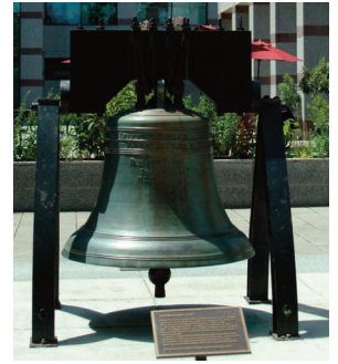
July 2, 2010.

Outside the North Carolina Museum of History is a life-sized replica of the well-known Liberty Bell. At the foot of the bell's platform is a metal plaque that reads: Beneath this point lies buried a time capsule from the Bicentennial year 1976 to be opened in the Tricentennial year 2076. What do you think is inside that time capsule?