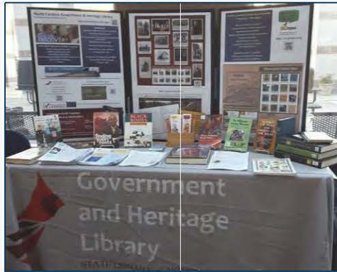
Government and Heritage Library exhibit table