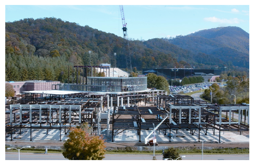
Fine and Performing Arts Center

Passage of North Carolina's Higher Education Bond Referendum in November 2000 will bring Western over $100 million to fund 10 facility construction projects, infrastructure improvements, land acquisition, and technology expansion. Construction projects include two new buildings, the Fine and Performing Arts Center and a 300-bed residence hall, and renovation of McKee, Bird, Killian, Killian Annex, Breese Gymnasium, Graham Infirmary, Stillwell and Forsyth buildings. Infrastructure improvements include chiller replacements, electrical distribution improvement and steam / condensate line replacement. Funds were also provided to improve traffic conditions on campus by relocating Centennial Drive and creating a pedestrian only quadrangle between Walker Residence Hall and Dodson Cafeteria. All of these projects, except for Forsyth and Graham, are either in construction or design.