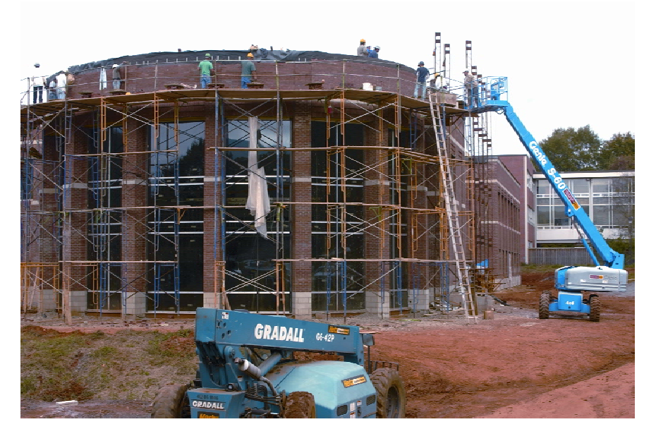
Workforce Development Center

A crucial element in the University's future will be our relationships with the University of North Carolina System and the North Carolina General Assembly, as we work to maintain competitive costs while providing an outstanding education for our students. There is a direct relationship between the growth of the University and the demand for State appropriations to operate the University. Also, declines in State appropriations generally exert pressure for increased tuition fee levels. As an institution targeted for growth in the years ahead, Western will be greatly affected by the availability and levels of State operating and capital resources to support that growth.