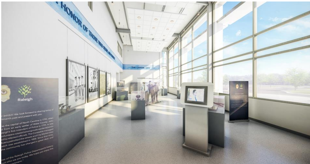
Rendering of lobby space prior to consultation with the public artist / artist team