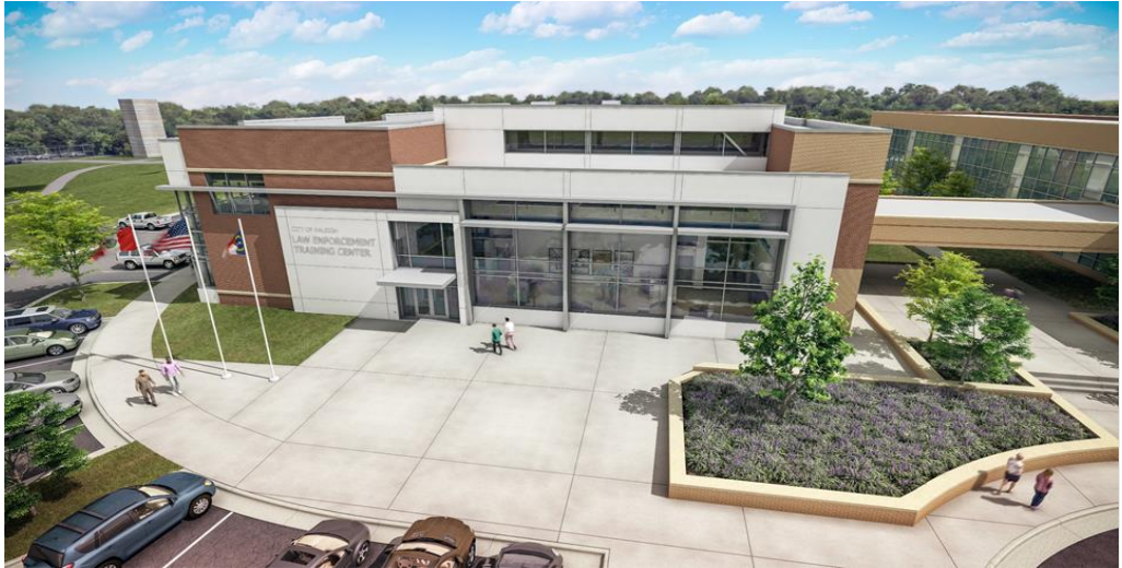
Rendering of the building Exterior

For the last two years, the RPD has had the opportunity to showcase memorabilia, artifacts and archival treasures at the City of Raleigh Museum. This new facility will offer the unique opportunity to incorporate those artifacts into artworks or exhibitions that can assist in engaging the public and inspiring the trainees who will serve our community.