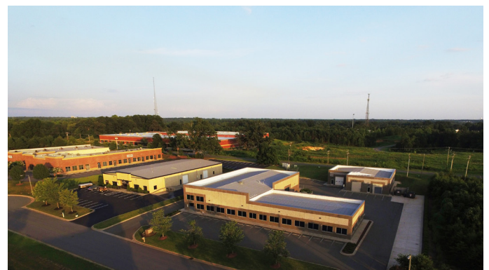
Corvid's current headquarters in Mooresville, NC.