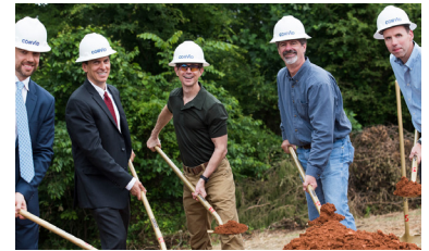
Corvid leadership breaks ground on a new $28.9 million corporate campus in Iredell County, NC, May 2018.