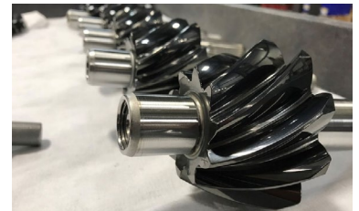
Gears to be protected with wear-resistant coatings.