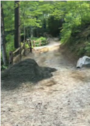
Triple Falls Trail - Before