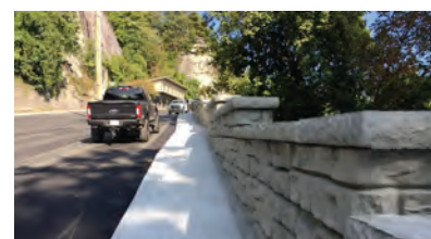
Parking Lot Wall Repair, Chimney Rock State Park