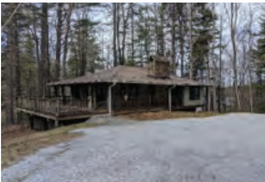
Old Camp Summit Cabin

Since its acquisition in 2000, this building had been unoccupied. It was once part of Camp Summit's facilities which still provide recreational benefits and office space for DSRF operations such as the equestrian facilities near Bridal Veil Falls and the Ranger Headquarters near Lake Julia. The approximately 40-year-old building was renovated with improvements to the roof, electrical systems, heating and cooling systems, and water supply systems. In addition, hazardous trees in proximity to the building were removed. This facility supports the operations of DSRF's law enforcement agents.