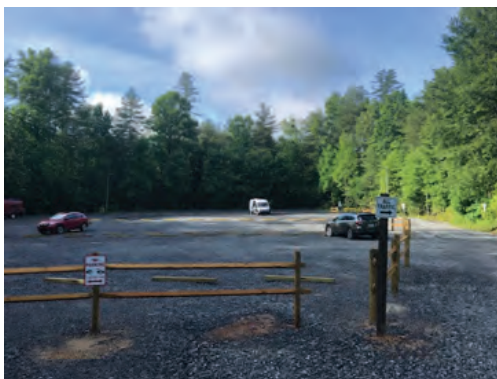
Lake Imaging Access Area

During fiscal year 2020-2021, DSRF undertook repairs and renovations to three of the most utilized access areas and parking lots in the Forest: Hooker Falls, High Falls, and Lake Imaging. Improvements included extensive grading, rebuilding gravel bases, stormwater management, erosion control measures, redesign of parking arrangements, directional signage, and stone stairways in select locations. These renovations improve the visitor experience by providing an organized parking accommodation and allowing for better emergency access to the more popular trailheads in DSRF. In addition, nearby sensitive areas such as streams and natural floodplain communities were further protected from stormwater and sedimentation impacts that were more prevalent before these improvements were made. Before and after images of the project improvements follow.