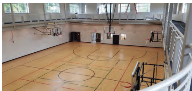
Creedmoor Community Center