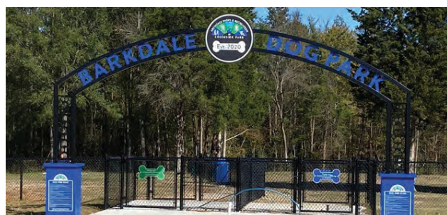
Creekside Park Enhancement, Archdale