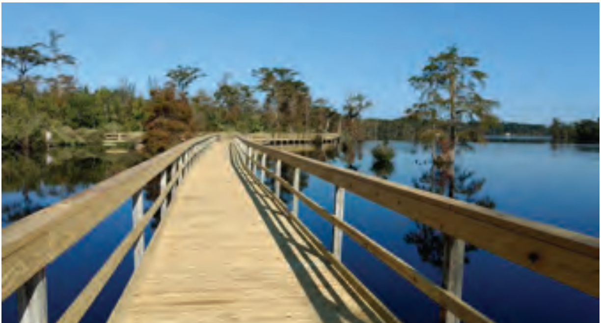
Pasquotank County Boardwalk

Local governments are required to match from 10 percent to 25 percent of the project costs based on the type of project being funded and the communities' economic status per the North Carolina Department of Commerce's Tier designations, as outlined by (§ 143B-437.08). The required cash match may include Federal and other State funds provided these funds are not already being used as match funds for any other state or federal program.