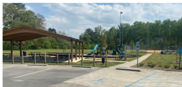
Briar Chapel Park, Chatham County