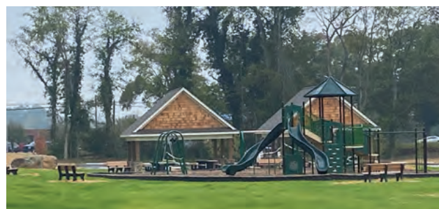
New London Park