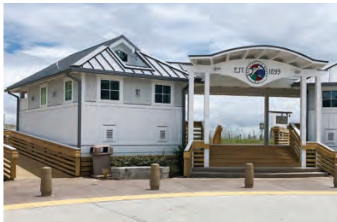
Salisbury Street Restrooms and Access, Wrightsville Beach