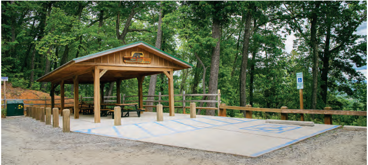
Mount Ida Wilderness Area, Marion

The North Carolina Parks and Recreation Trust Fund (PARTF) was established in July 1994 to provide a dedicated funding source for improvements in state parks, matching grants for local parks and public access to the state's beaches and estuaries. PARTF is funded by an annual appropriation as well as revenue from personalized license plates. The Parks and Recreation Authority, a citizen board, allocates PARTF revenue for projects in state parks and for grants to local governments to buy parkland and build facilities for public recreation.