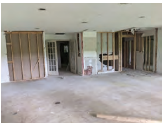
Ranger Headquarters at Lake Julia

This facility has served as the main office for forest ranger staff since the early 2000s. It was previously an overnight lodge used by the DuPont Corporation before becoming state property. Before the DuPont Corporation's ownership and until the mid-1980s, the building served as the infirmary for the summer operations of Camp Summit. In 2019, mold contamination was detected in parts of the facility, making it a high priority for renovation and structural improvements. During 2021, PARTF funds were used for designing renovation work, which includes new electrical system layouts, updated heating and cooling systems, a new floorplan to support forest administrative and operational work, and the removal of mold sources throughout the structure. Remodeling construction is expected to be complete by October 2022.