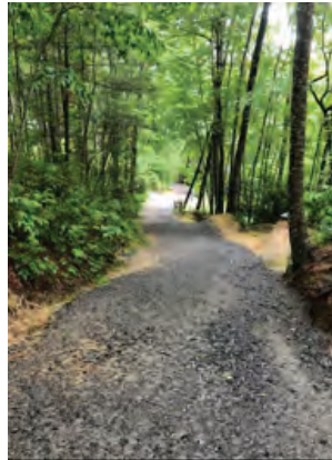
Triple Falls Trail - After

Forest trails at DSRF constitute one of the most extensive outdoor recreational systems in North Carolina. These natural surface pathways endure traffic from bicyclists, equestrians, hikers, and forest ranger operations with vehicles. In addition, these trails are exposed to significant rainfall contributing to continuous erosion and sedimentation. The maintenance of this trail system is a year-round operation and requires an investment of materials and labor. During fiscal year 2020-2021, DSRF used PARTF funds to purchase gravel, fencing and erosion control materials to be able to repair and renovate Triple Falls Trail, one of the most traveled trails in the forest with approximately 400,000 visitors using it each year.