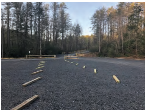
Hooker Falls Access Area