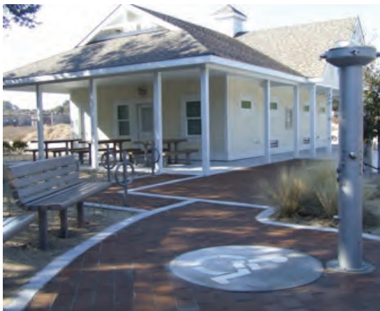
Corolla Village Bathhouse, Currituck County

State appropriations are allocated to DCM through PARTF. The amount transferred from the PARTF to DCM during fiscal year 2020-21 was $850,929. The amount budgeted for grants in addition to this allocation include funds unused from previous fiscal years and returned funds from previous grants. Table 6-1 provides the list of local governments that have been awarded grant funding. Additional information on current and past grants awarded can be found here .