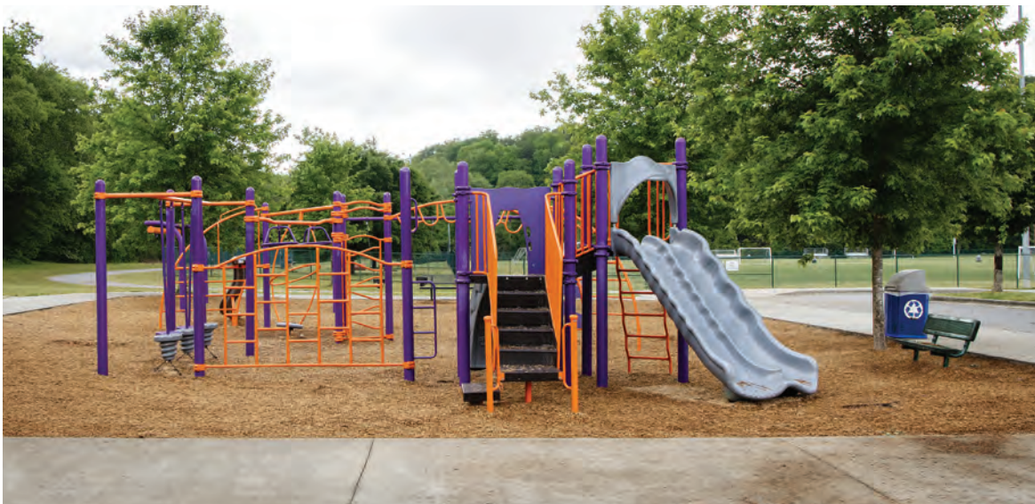
Catawba River Soccer Complex, Morganton