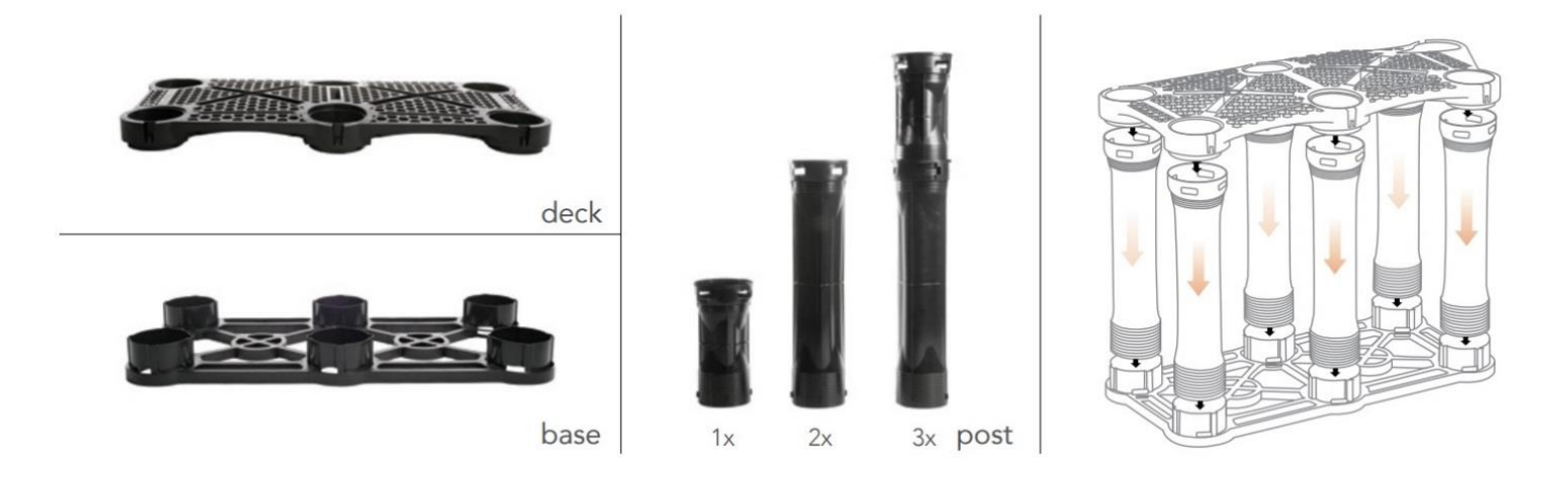
Figure 2: Silva Cell 2 (Left: 1x, Middle: 2x and Right: 3x)