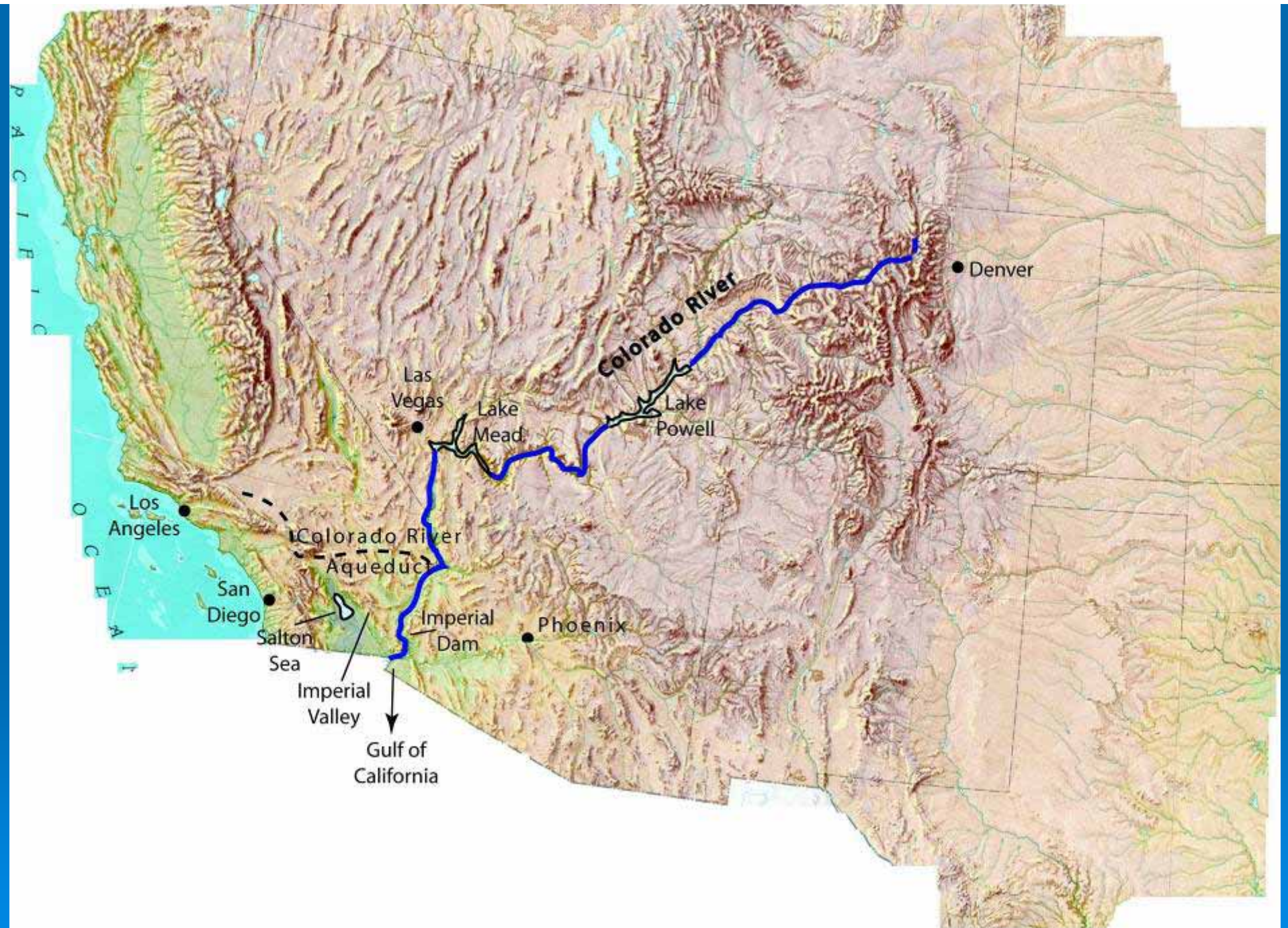
Colorado River flowing toward the Gulf of California (Pacific Basins)