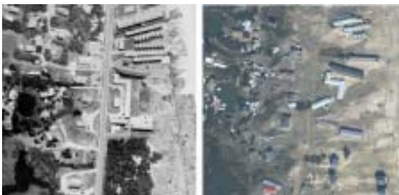
Figure 2: A coastal area before and after the storm.

It became immediately apparent that local governments had a wealth of digital GIS information that could be extremely beneficial to emergency responders. This data was available from over half of the affected counties and the accuracy and currency was much better than the Census data that FEMA has had to rely on. Many examples were given on how digital parcel information from local governments could improve the ability of FEMA and state agencies