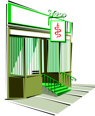
Raleigh location of ABC Healthcare