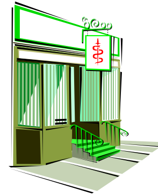
Durham location of ABC Healthcare

Dr. Jones may use encounters from multiple locations, but is not required to report on more than one location, but it is required to report on at least one location with certified EHR technology. She has two options for reporting patient volume from either or both locations using individual methodology for multiple locations: