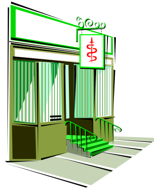
Raleigh location of ABC Healthcare