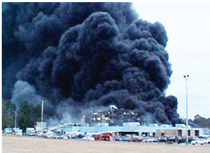
A fire burns following an explosion of fine plastic powder.

In North Carolina, an explosion of fine plastic powder used in the manufacture of polyethylene products killed six people and injured 38. In Pennsylvania, wood dust in a particle board manufacturing plant explosion killed three and injured 10. In Mississippi, rubber dust exploded in a rubber manufacturing plant, killing five and injuring 11. Also, in Kansas, a series of wheat-dust explosions in a large grain storage facility resulted in the deaths of seven people. Accident investigators in each of these facilities, although different industries, found similar conditions that resulted in a massive, tragic dust explosions.