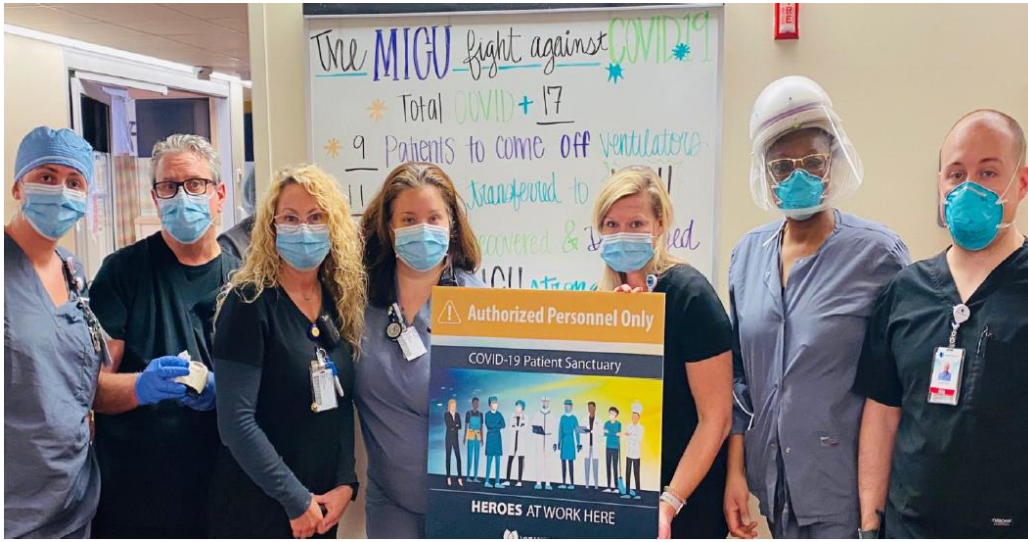
Vidant Health COVID-19 Patient Sanctuary Team Members

Vidant Health, including Vidant Hospital locations, has been significantly challenged during the ongoing COVID-19 pandemic. While reducing non-essential procedures and significantly reducing both outpatient activity and inpatient volumes, the entity has continued to incur significant additional expenses.