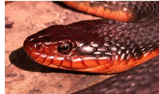
Note the round pupil in the eye of this harmless Red-bellied Water Snake.