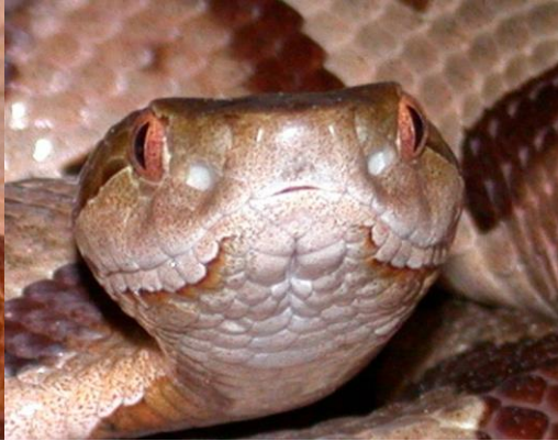
The pits viewed head on