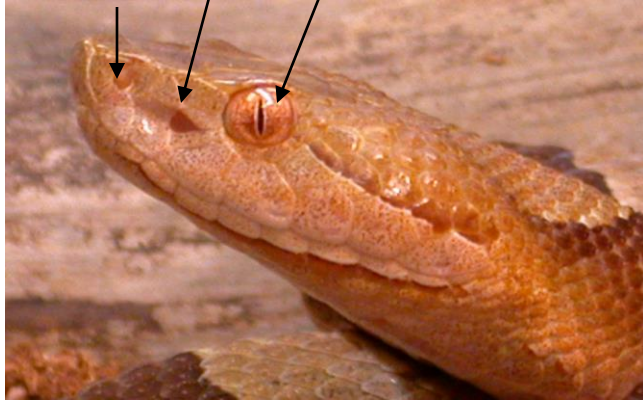
NOSTRIL PIT EYE with elliptical pupil