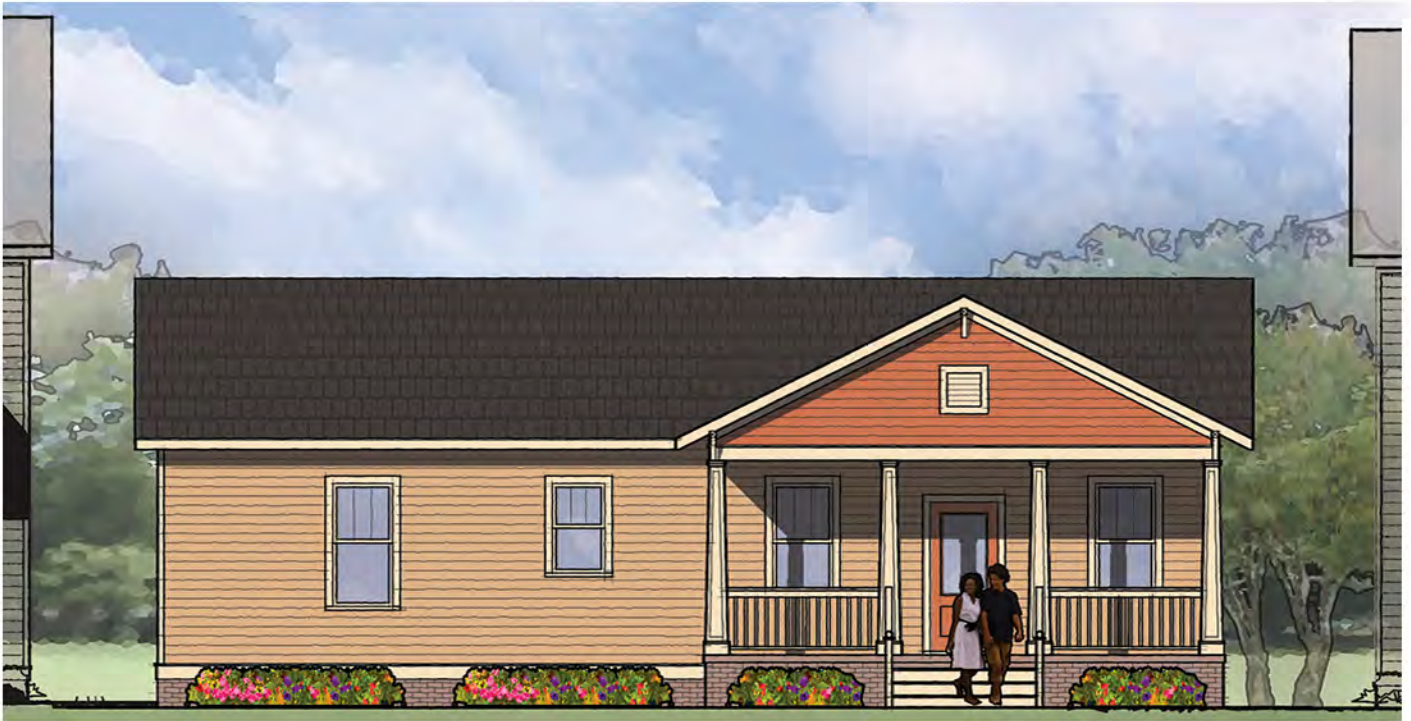
Haywood II Ranch